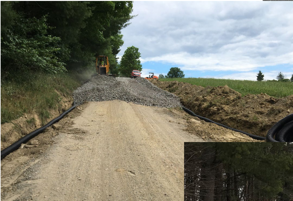
During Fill and Under Drain