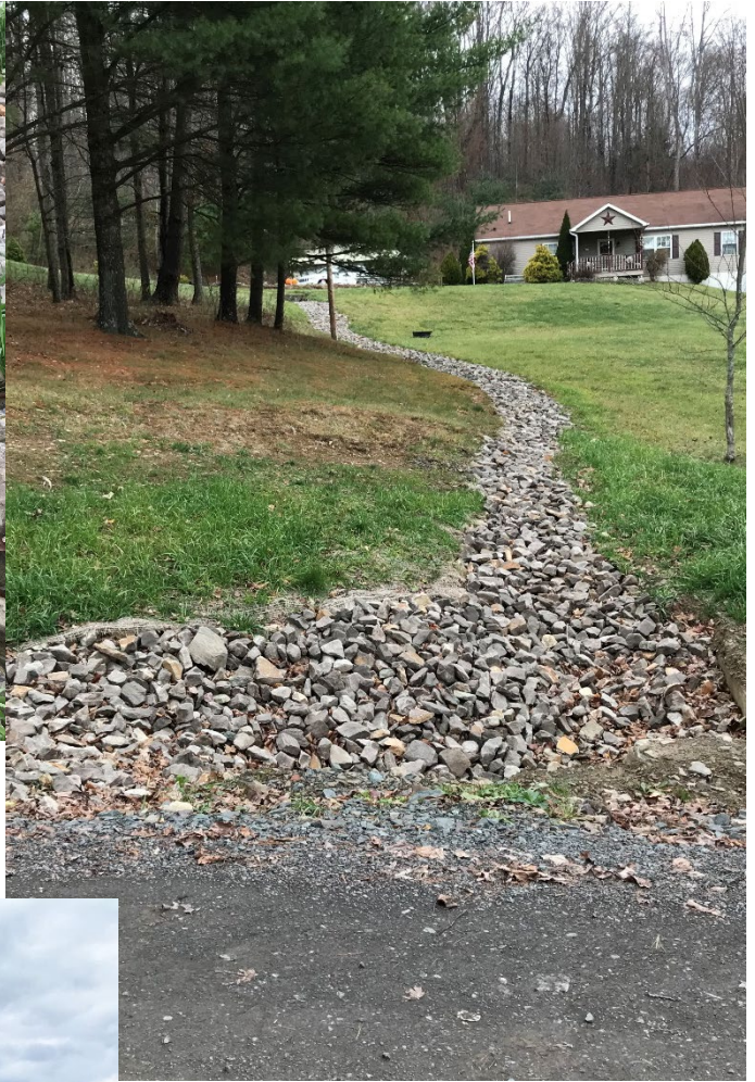
Stabilized offsite drainage.