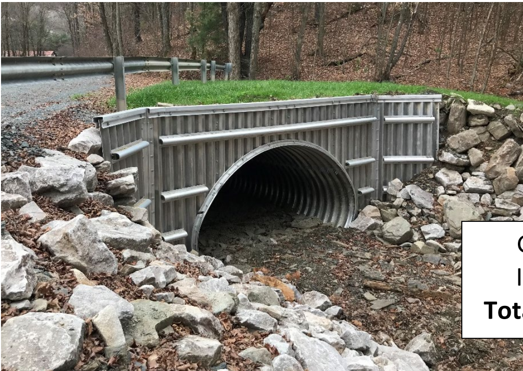
14' stream crossing replacement

Grant: $217,792.61 In-Kind: $64,994.87 Total Value: $282,787.48