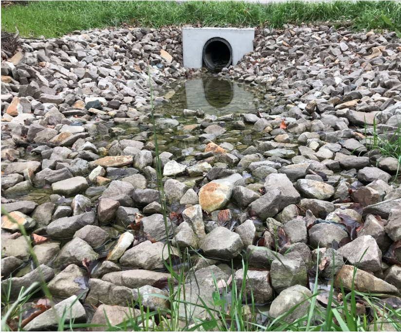
Stabilized Rock Outlet