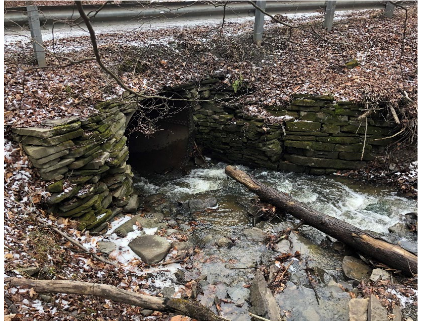
Existing 6.5' Stream Crossing